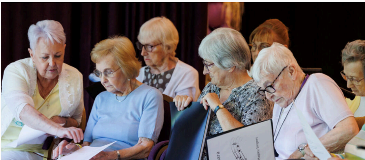
Our Community Choir members

We are a really diverse group and I love the camaraderie, the respect for one another and the development. so that we can collectively produce a more cohesive sound as a group. This is an amazing accomplishment given that many of us including myself don't read music and only ordinarily sing into shampoo bottles in the shower!