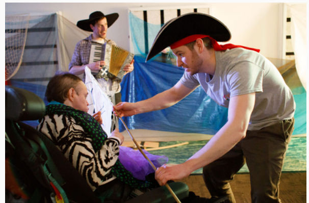
An SFE staff member with a Tiger Tiger participant

Led by experienced staff, our Birmingham Inclusive Choir and Tiger Tiger projects create special musical moments for children and young people with disabilities, offering fully inclusive music-making and sensory based activities at their level of choice and engagement.