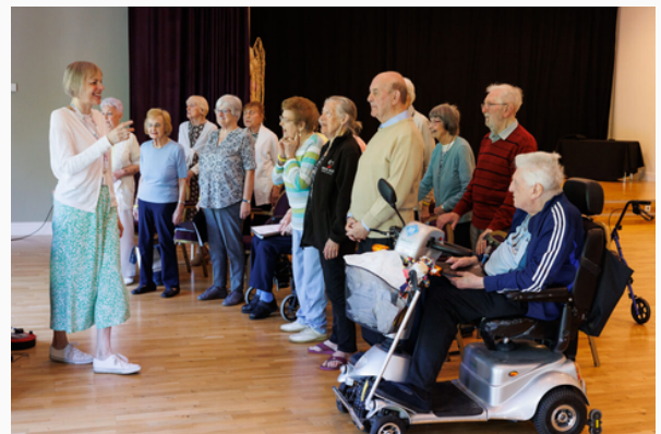
A Community Choir rehearsal led by SFE staff member

Our Community Choir offers people aged 55+ the chance to come together to share their love of singing and reduce isolation, particularly impacting people with dementia, helping them rekindle a passion and/or a memory.