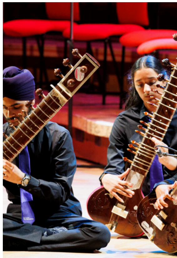
Sitar musicians at a Youth Proms event