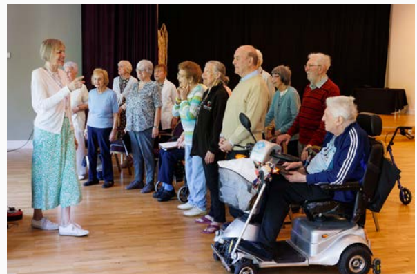
A Community Choir rehearsal led by SFE staff member

Our Community Choir offers people aged 55+ the chance to come together to share their love of singing and reduce isolation, particularly impacting people with dementia, helping them rekindle a passion and/or a memory.