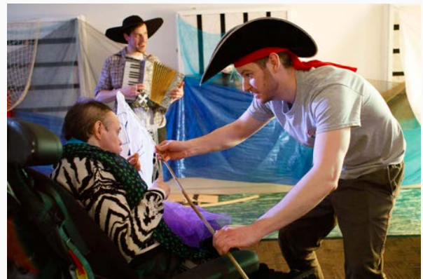
An SFE staff member with a Tiger Tiger participant

Led by experienced staff, our Birmingham Inclusive Choir and Tiger Tiger projects create special musical moments for children and young people with disabilities, offering fully inclusive music-making and sensory based activities at their level of choice and engagement.