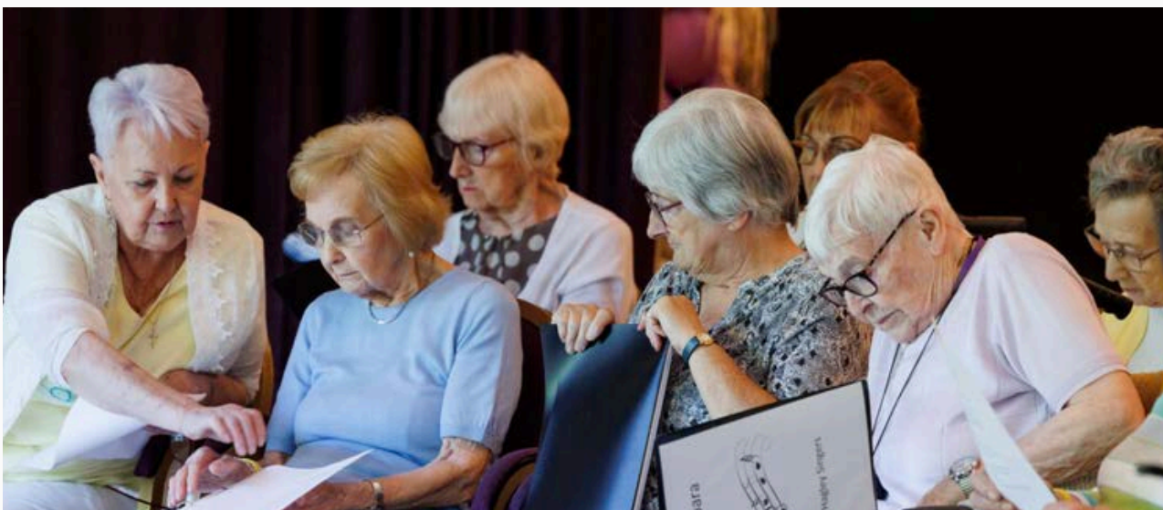
Our Community Choir members

We are a really diverse group and I love the camaraderie, the respect for one another and the development. so that we can collectively produce a more cohesive sound as a group. This is an amazing accomplishment given that many of us including myself don't read music and only ordinarily sing into shampoo bottles in the shower!