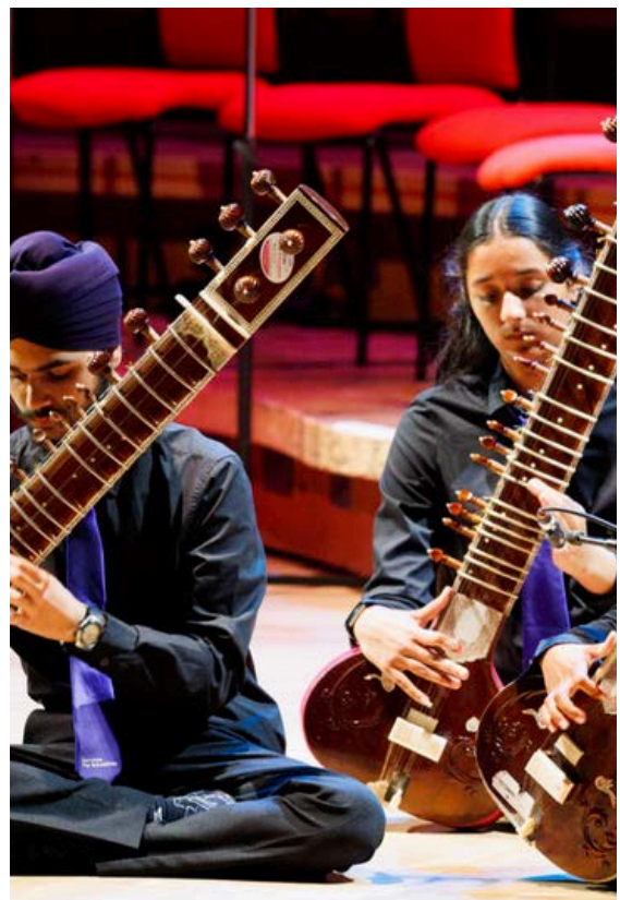
Sitar musicians at a Youth Proms event